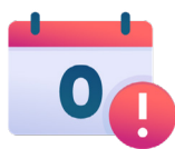
Zero day threat removal