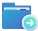
Document, data and records migration