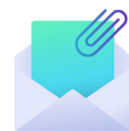
Secure email attachments