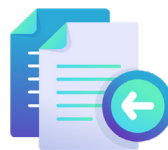
Bulk file imports